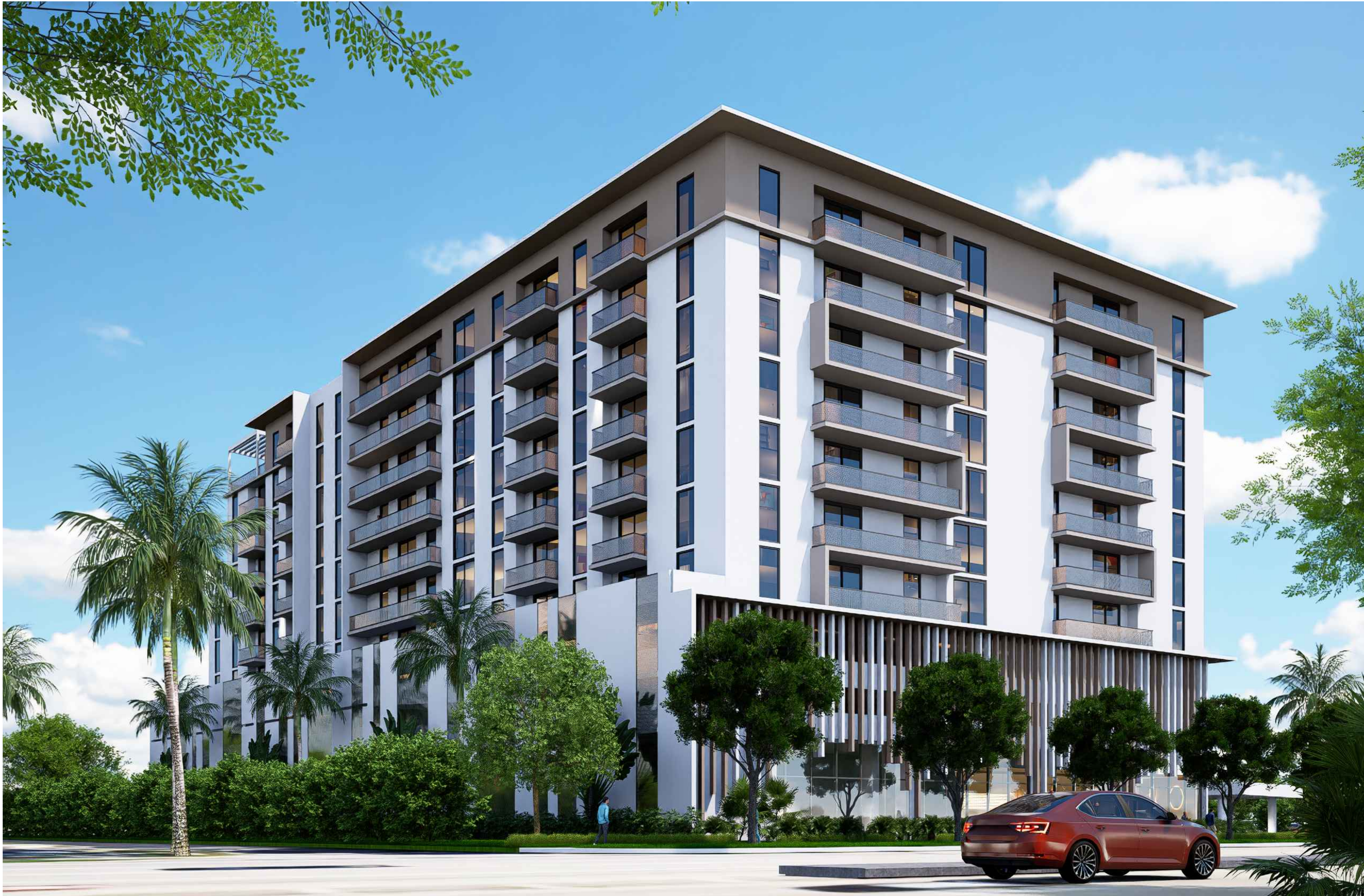
STREET VIEW OF THE SOUTH WEST CORNER OF THE BUILDING